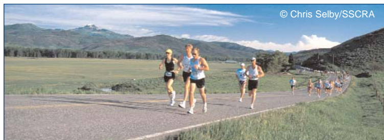
For 25 years, the Steamboat Marathon, Steamboat Springs' official opening of summer, attracts runners as far as Hawaii every June