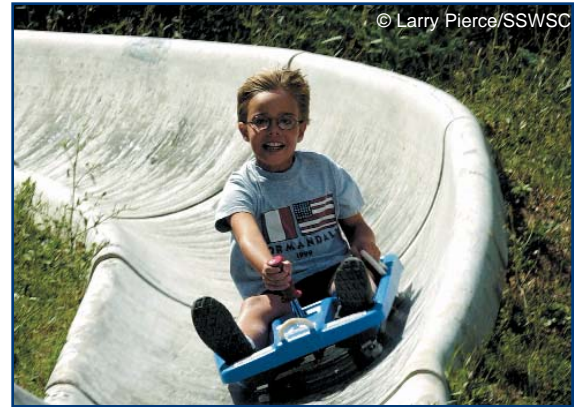
Flying down the Howler Alpine Slide fun for the whole family and a fundraiser for the Steamboat Springs Winter Sports Club

5. Town Challenge Mountain Bike Series: Includes a children's division so the whole family can compete.