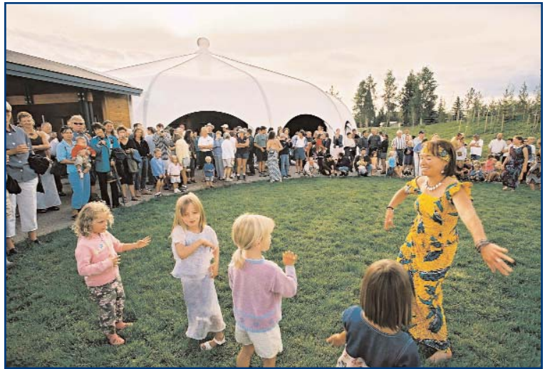
Children dance the day away with Strings in the Mountains Youth and Family Concert Series