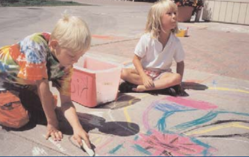
Chalk art at the Beaux Arts Festival