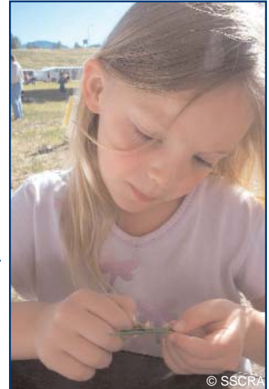
Learn about bugs with Yampatika

970-879-4300. For more information visit www.steamboatspringsarts.com