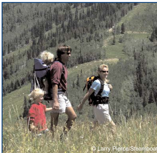
Hiking at the Steamboat Ski Area

5. Scenic Gondola Rides: almost like flying above the valley, only a hot air balloon ride can beat these views. Enjoy panoramic views of the whole valley and the gateway to hiking and biking.